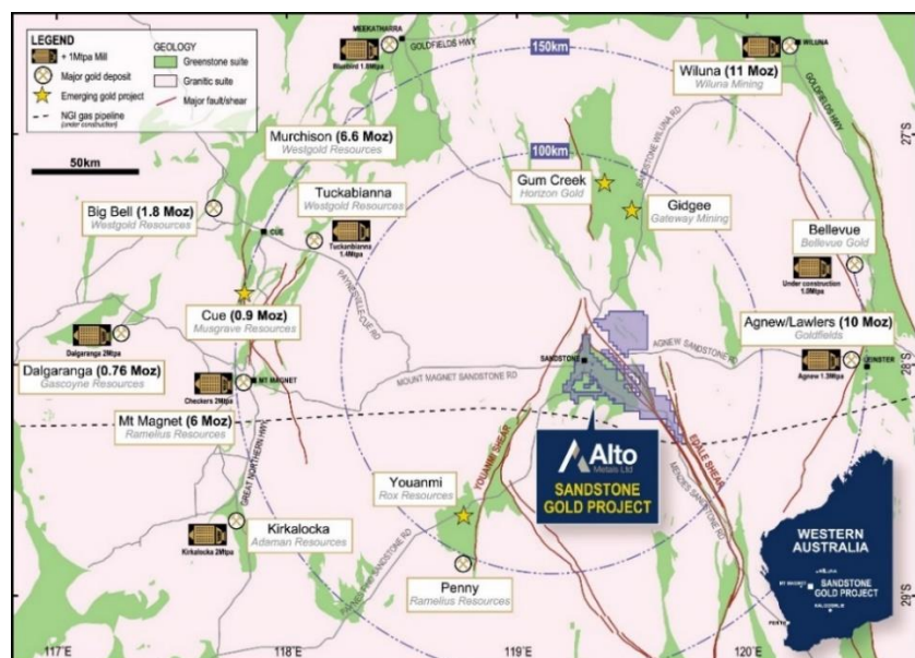
Figure 2. Location of Sandstone Gold Project within the East Murchison Gold Field, WA

The Sandstone Gold Project covers ~740km 2 of the Sandstone Greenstone Belt and currently has an optimised, open-pit constrained mineral resource estimate of 832,000oz gold at 1.5g/t, capturing over 80% of the unconstrained total MRE of 1.05Moz. Importantly the mineral resources are shallow with over 90% within 150m from surface Alto is currently focused on growing these resources through continued exploration success and new discoveries.